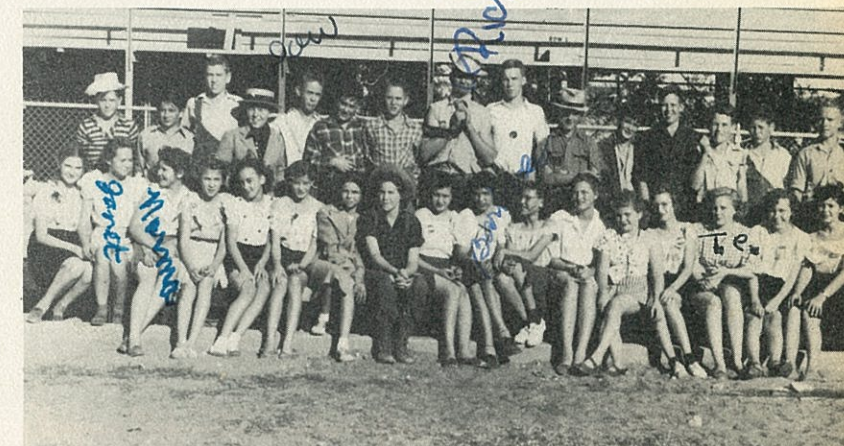
What a race! The girls look victorious but don't the boys look sad.

For the first time Junior High was 'way out in front on Sadie Hawkin's Day. Outrageous garb, that clasified them as real Dog-patchers, and a million pranks enlivened the atmosphere.